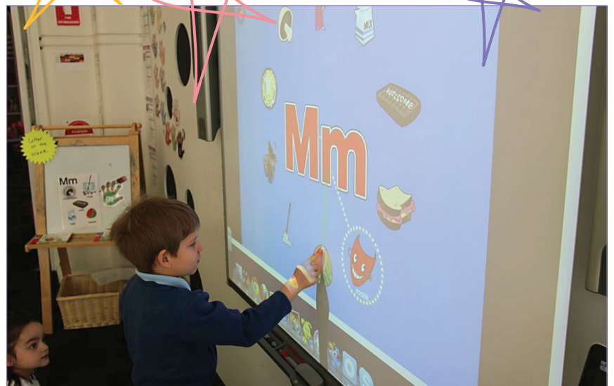
Interactive activity with letter of the week focus.

Please contact an ELECTROBOARD Education Consultant to find out more: